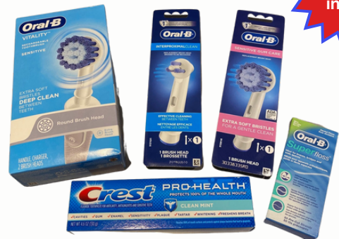
Oral B Electric Toothbrush Package (Includes custom heads for braces)

Riverdale k/dds Pediatric Dentistry Coon Rapids, MN 763-767-1524