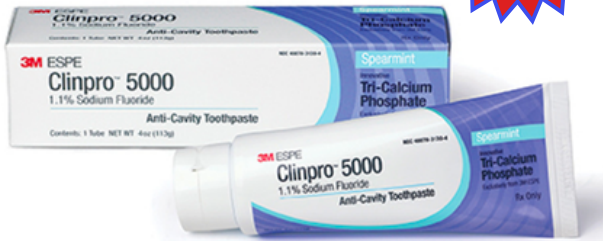
Clinpro 5000 Anti Cavity Toothpaste