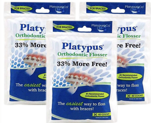
Platypus Orthodontic Flossers